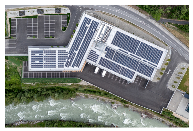
Bird's eye view of the entire building