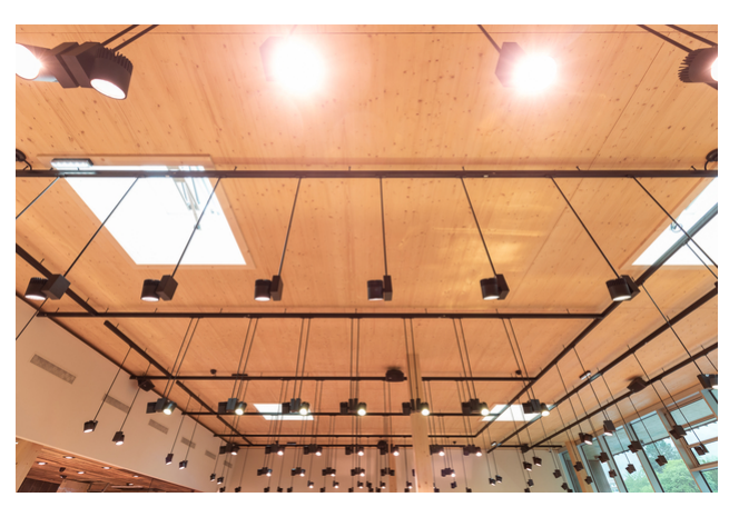
CLT panels on the wooden supports with a grid of 7 x 7 meters